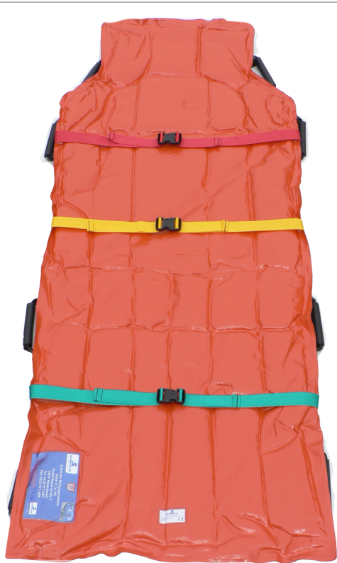
Art.-Nr.: 820 K